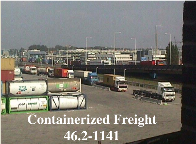
Containerized Freight 46.2-1141