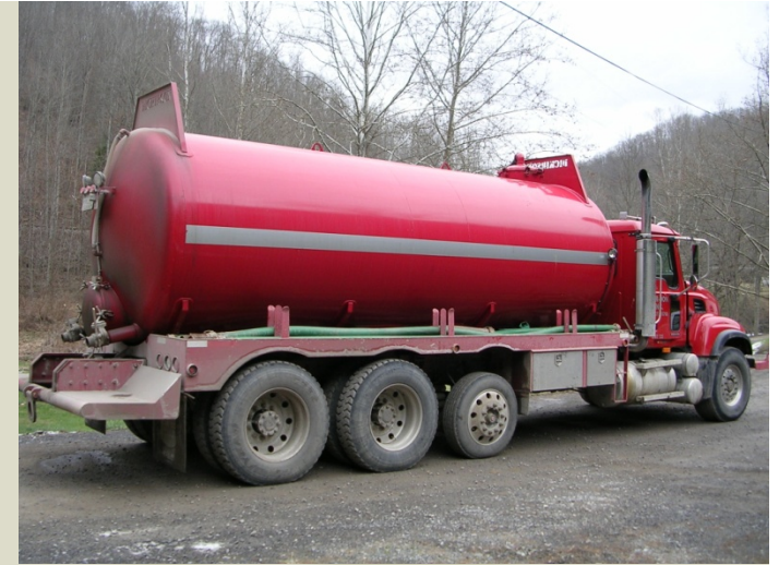
Trucks Hauling Liquids Produced for a Gas or Oil Well 46.2-1143