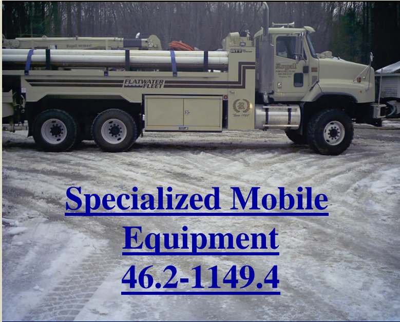
Specialized Mobile Equipment 46.2-1149.4