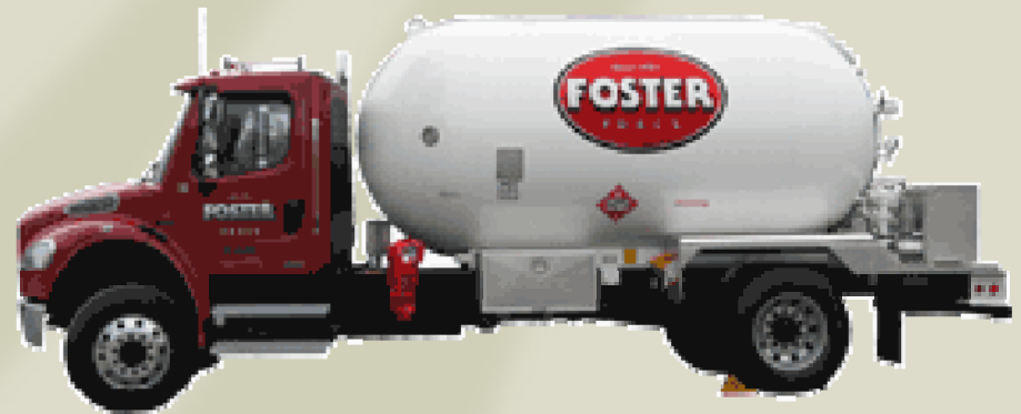
Tank Wagon 46.2-1144.1