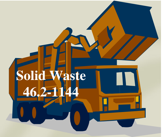
Solid Waste 46.2-1144