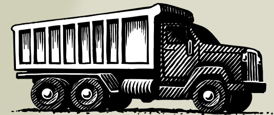
Excavated Material 46.2-1143.1