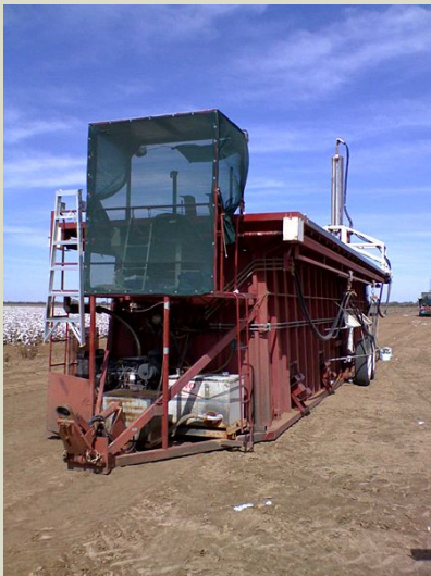
Cotton Module 46.2-1149.1