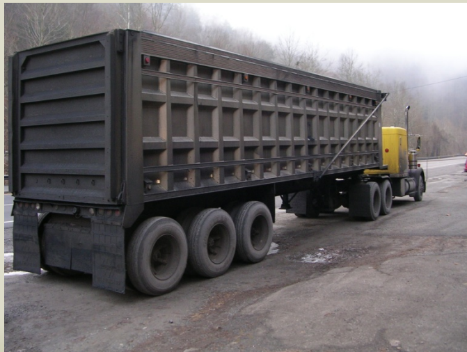
Coal Truck or Sand & Gravel Truck 46.2-1143